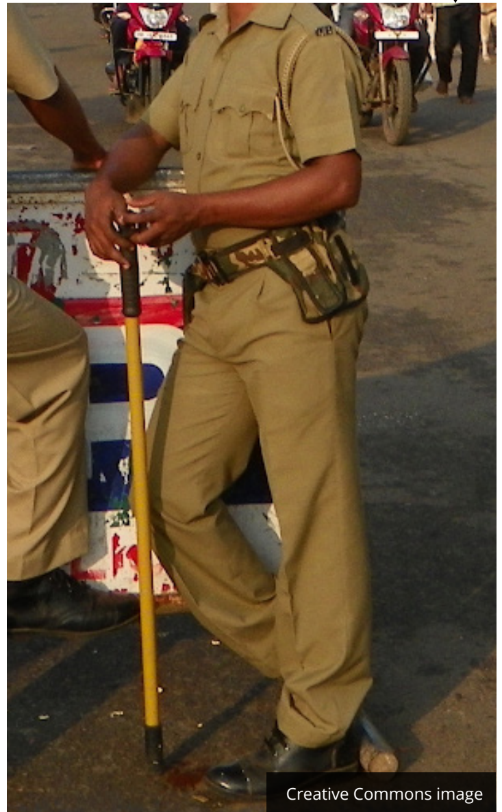
Creative Commons image

Use and Concerns: The extra length of lathis means that they deliver a greater level kinetic force than conventional batons, causing excessive pain and increasing the risk of serious injury. Certain types of heavier lathis are particularly dangerous. Their use fulfils no legitimate law enforcement purpose that cannot be achieved through the use of standard batons.